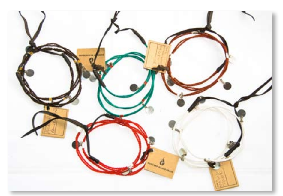
800 KES 11 USD

Our top selling accessory! A maasai necklace in modern design. A long necklace made out of two strands of beads put together and finished with suede straps. Decorated with metal jingles on chains. Wear it as a long necklace, wrap twice around your neck, around your wrist/ankle or as a thin decorative belt over your favourite dress.