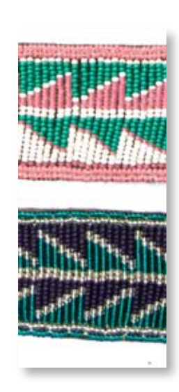
Turquoise/Marine Mid green/Pink Marine/Red White/Silver Amber/Shiny Brown