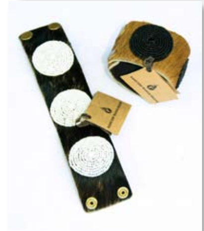
White 03050 Black 23980